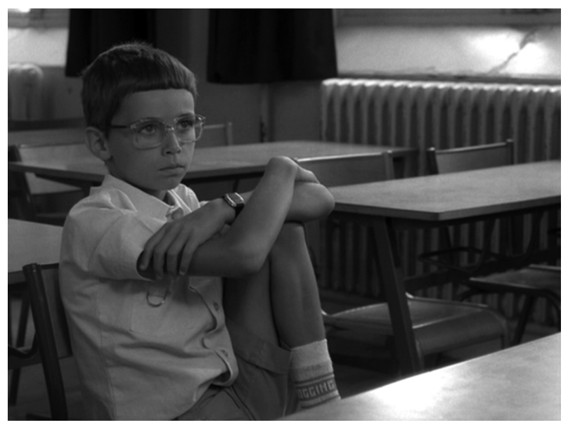
Straub & Huillet. En rachâchant, 1982. 35mm film transferred to video, b&w, sound, 7 min.

How societies define and distribute knowledge indicates the means whereby they are structured, their dominant social order, and their degrees of inclusion and exclusion. The exhibition Really Useful Knowledge looks into diverse procedural, non-academic, antihierarchical, grass-root, heterodox educational situations primarily occupied with the transformative potentials of art.